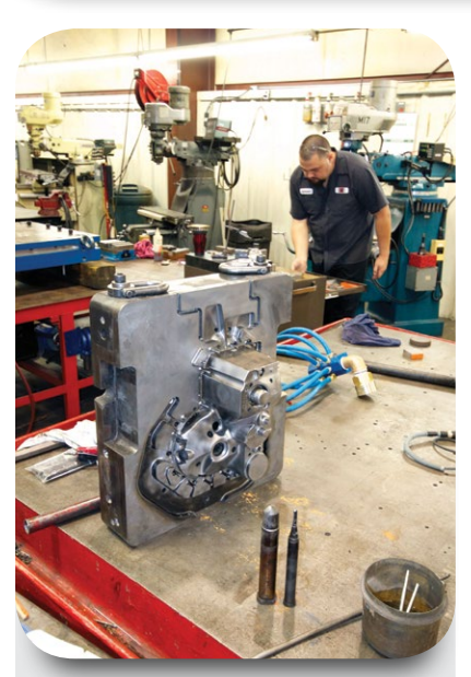
JMMS craftsmen have decades of experience with preventive maintenance and complete refurbishment