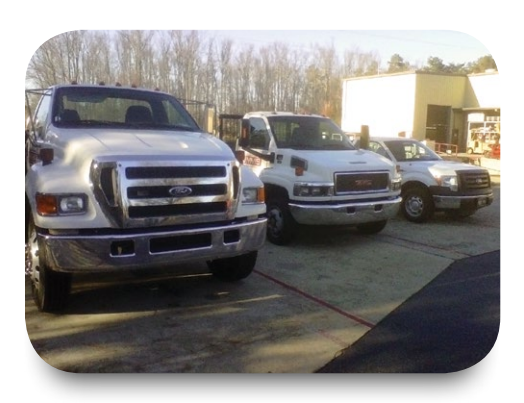
The JMMS truck fleet handles fast pickup and delivery for tooling maintenance, repairs and refurbs.

Our dedicated maintenance operation provides preventive services, repairs and modifications for molds and dies — which includes ours and tooling from other suppliers.