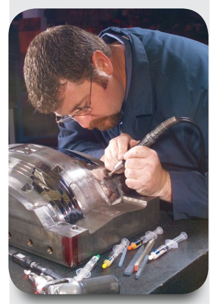
JMMS maintenance is available on-site or at our plant in Easley, South Carolina

JMMS, Inc. 807 Sheffield Road Easley, SC 29642 864.855.0450 864.855.0452 (FAX)